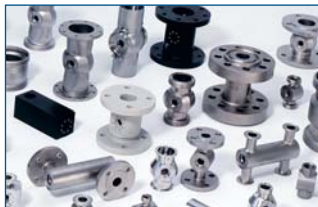
Measuring cells for any application